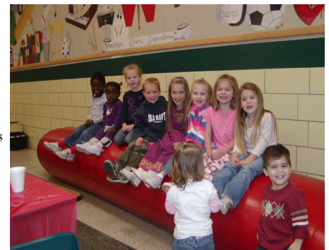
Our children waiting for turkey and all the trimmings. Harvest Dinner held at the Williamson High School on Nov.18th

See more pictures Inside Pull Out Edition.